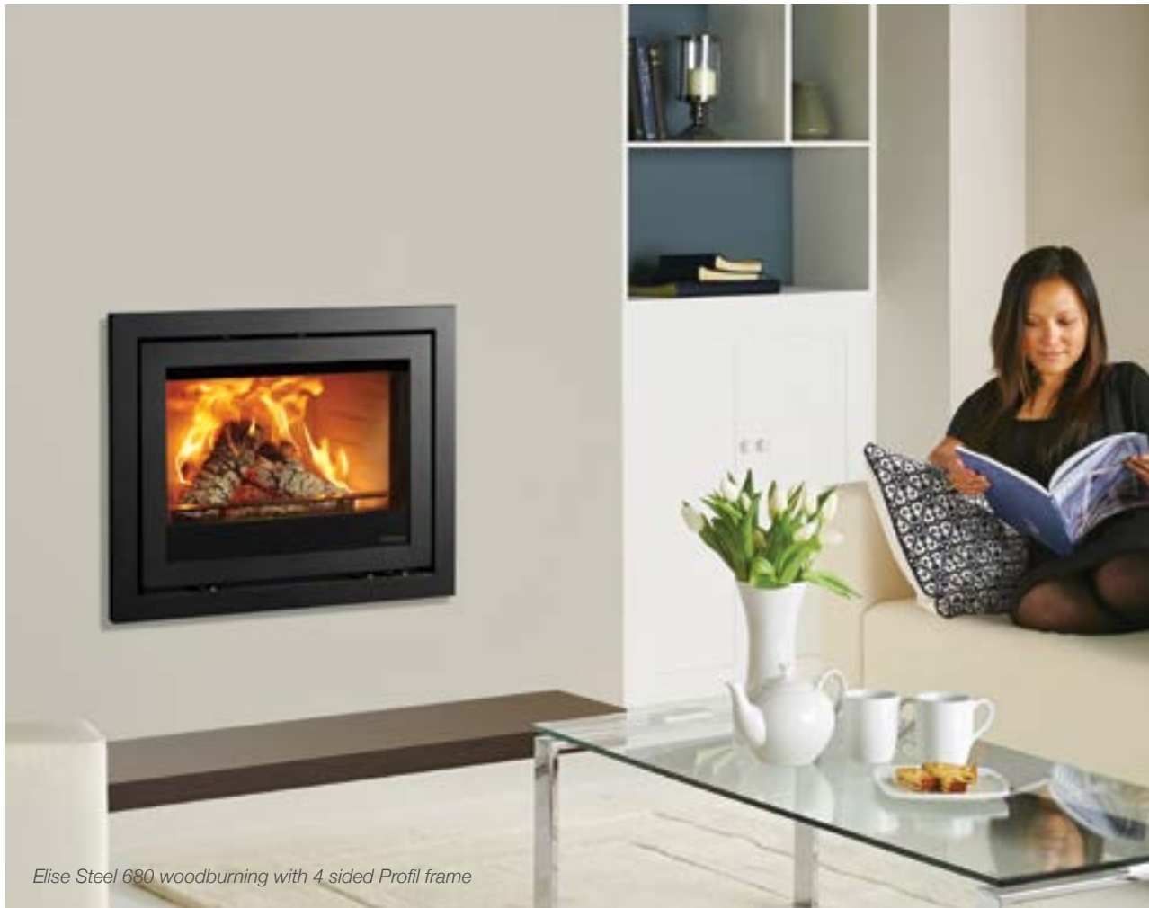
Elise Steel 680 woodburning with 4 sided Profil frame

In addition to the Freestanding models, the Elise family also includes a range of Steel and Glass fronted cassette fires which are featured in a separate Elise brochure. Within, you will also find detailed information regarding the Elise range's compliancy with future Ecodesign efficiency and emission standards, one of the many reasons that makes this range the gold winner of 'Best Heating Product' in the highly regarded House Beautiful awards.