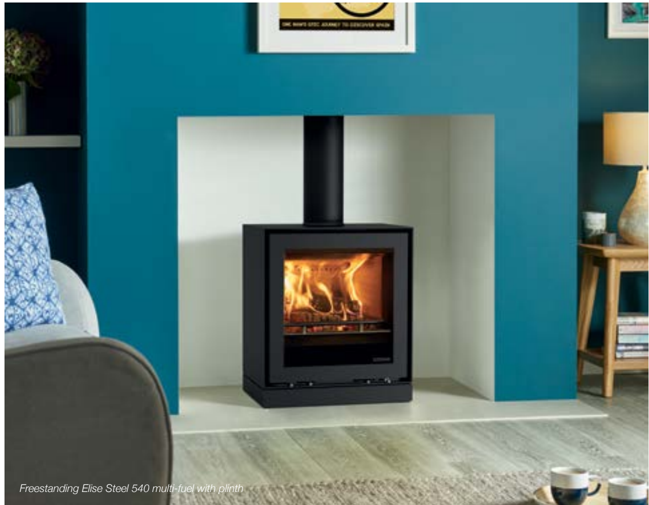
Freestanding Elise Steel 540 multi-fuel with plinth