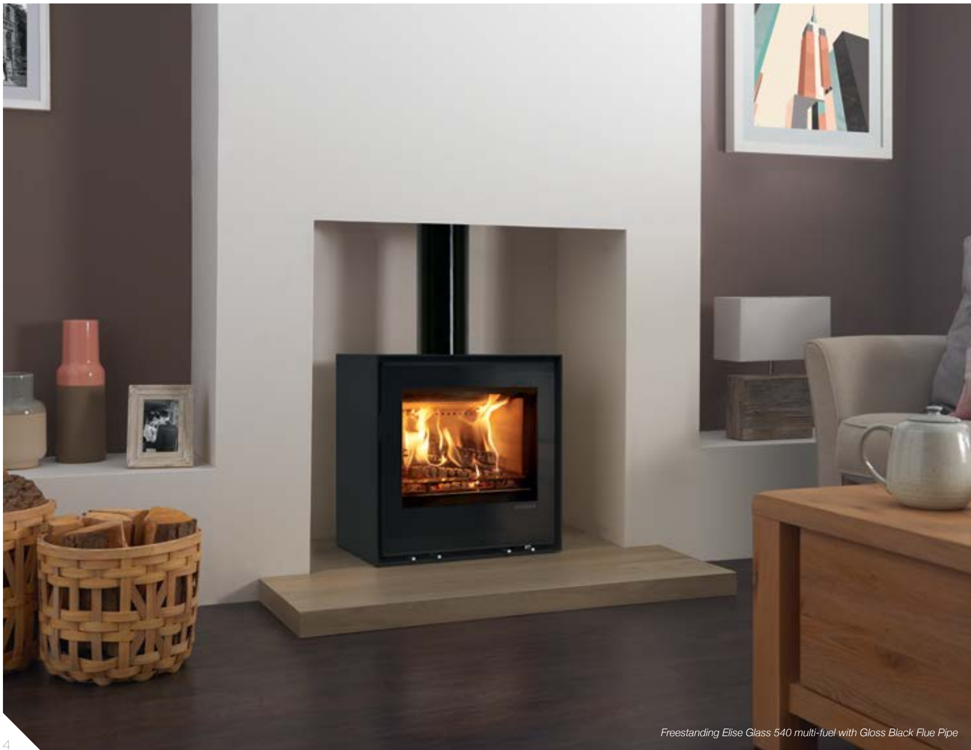
Freestanding Elise Glass 540 multi-fuel with Gloss Black Flue Pipe