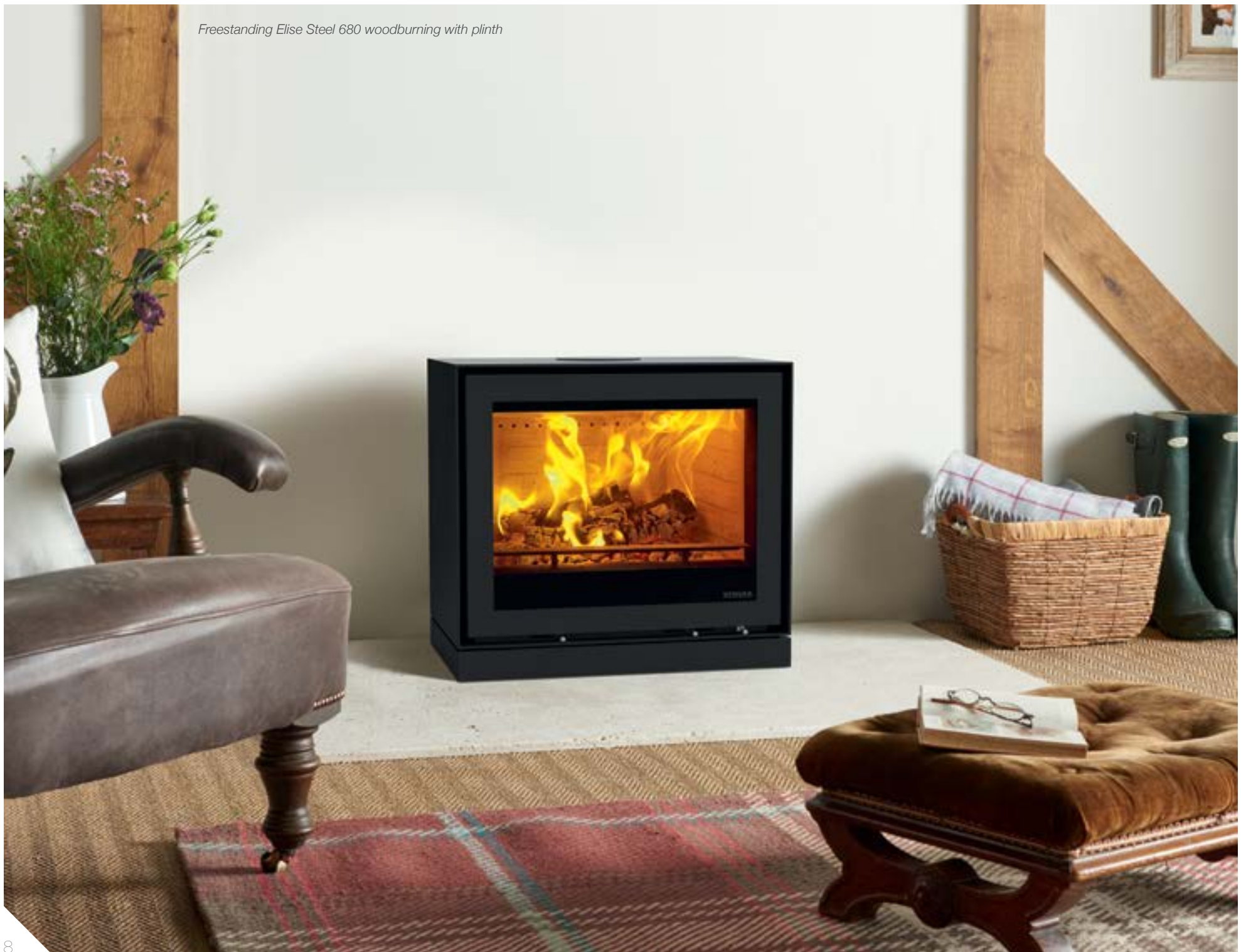
Freestanding Elise Steel 680 woodburning with plinth