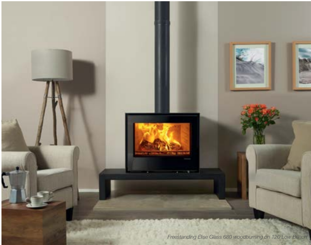
Freestanding Elise Glass 680 woodburning on 120 Low Bench

Featuring an expansive viewing window for a spectacular flame picture, the Freestanding 680 offers a powerful 7kW of heat output in an eye-catching, landscape form. This versatile stove has the option of either Glass or Steel front and can be hearth mounted or styled with either matching plinth or stove bench.