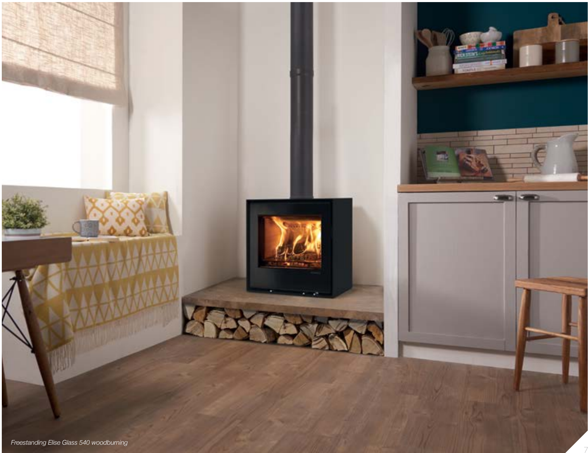
Freestanding Elise Glass 540 woodburning