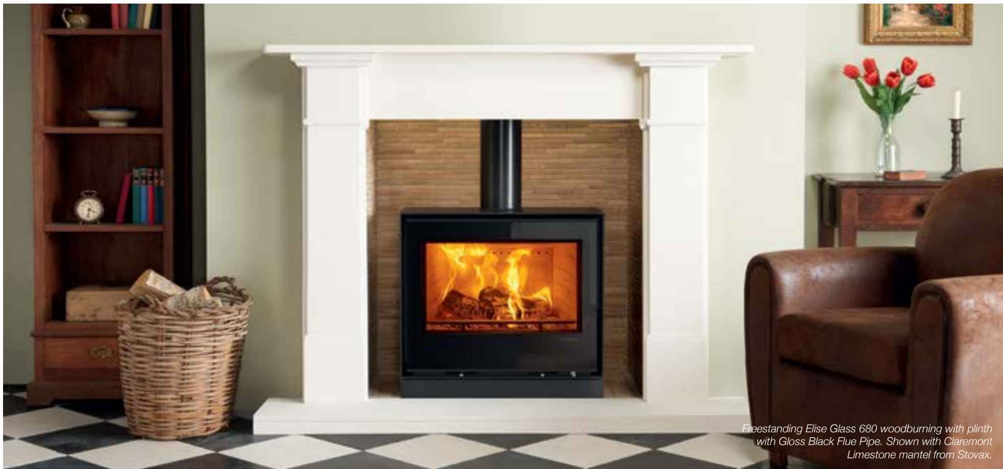
Freestanding Elise Glass 680 woodburning with plinth with Gloss Black Flue Pipe. Shown with Claremont Limestone mantel from Stovax.